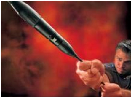
Figure 1: Pomona's connector construction showing cable clamp with 45 kg pull strength – double the previous industry standard.

The worst results exceeded 30,000 bends, and some cables withstood up to 50,000 bends. As a comparison, leading Test & Measurement companies like Fluke consider 10,000 bends to show excellent performance (Pomona established its reputation in the professional Test & Measurement market before producing audio cables).