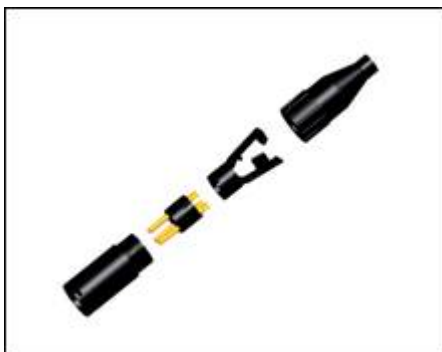
Figure 2: The connector is designed for easy, yet rugged, attachment to the cable. IDC connectors that do not require soldering are also available.